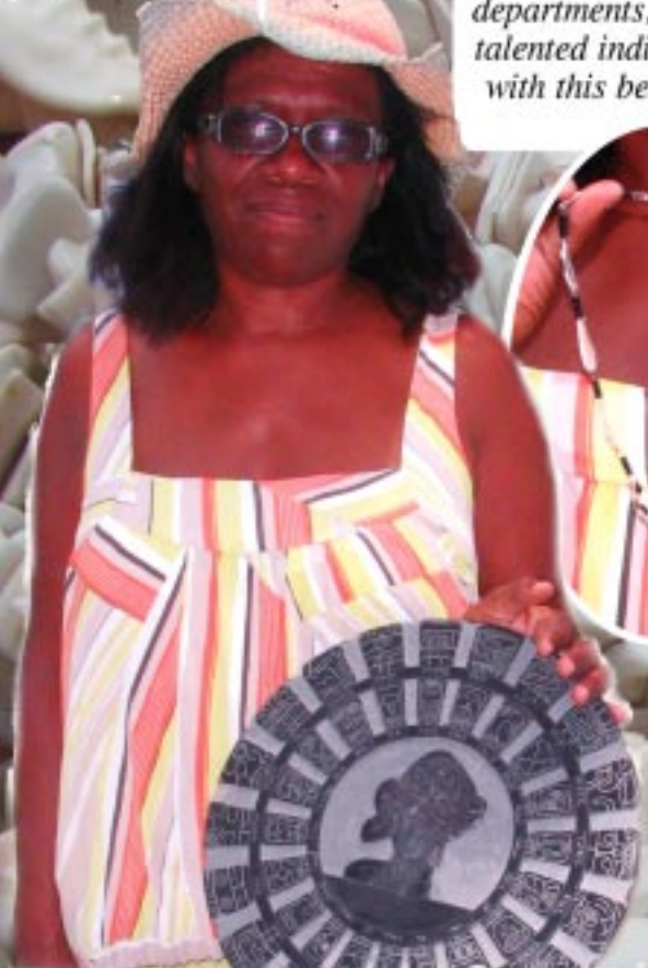
Slate Carvings from Succotz artists.

Talent can be described in many forms. What no one can deny is that talent also requires passion and love. Whether it is for a small art and craft project or an elaborate stage setting, talent can transcend many departments, art, music, culinary, etc. Through this new column, The San Pedro Sun intends to honor the many talented individuals on the island, be it that they were born here or those who have fallen head over feet in love with this beautiful country and opted to call it home. Talent that has captured this tropical island in a magical way should be highlighted, and that is exactly what we aim to do with Local Talents.